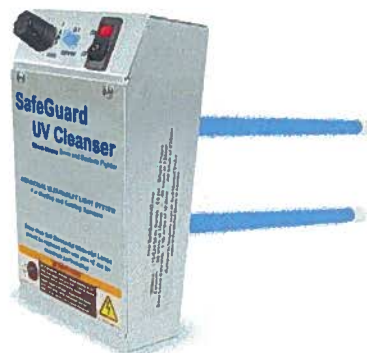
THE SAFEGUARD UV CLEANSER PICTURED: TWIN LAMP MODEL

Above: Petri Dish View of the sterilizing powers of the SafeGuard UV Cleanser. In the left side view, the Safeguard's Germicidal Ultraviolet lamp was exposed over the same sample of household air as the right side. After just 72 hours the right side shows a visual of contaminated air all bloomed out.